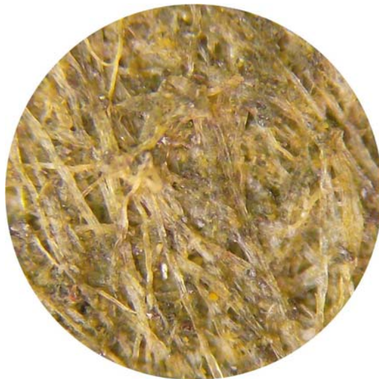
Microstructure of P204 50X